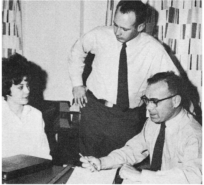
Working up Airmen personnel figures