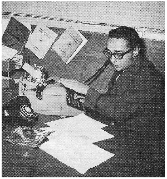
Getting out a news release