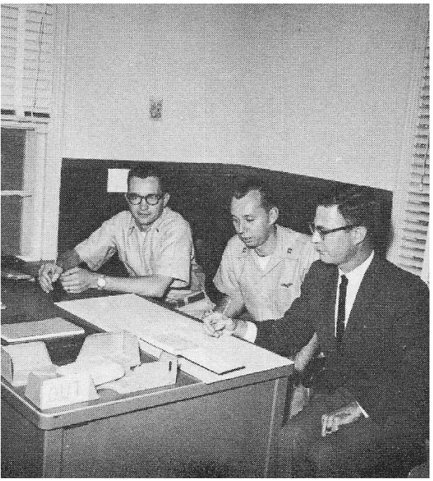
Resident auditors complete audit

USAF Unit Histories Created: 20 Sep 2021 Updated: